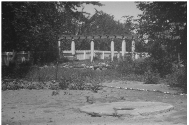
1930's image of the garden showing the pergola

Take a moment to enjoy the gardens of the Narragansett Historical Society and take notice of these elements as well as the large collection of perennials, shrubs and trees. Many of these plantings have been a part of this landscape for decades and some of the trees have been around for a century.