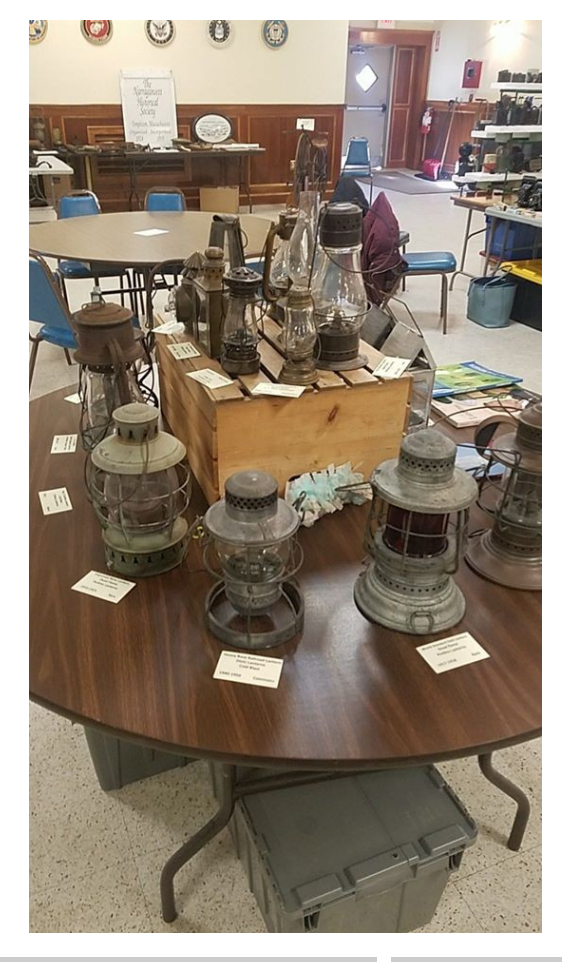
Check Us Out at: www.narragansetthistoricalsociety.org OR on FACEBOOK