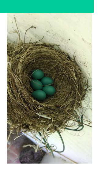
Robin's nest in our Back door Entry way Use Caution