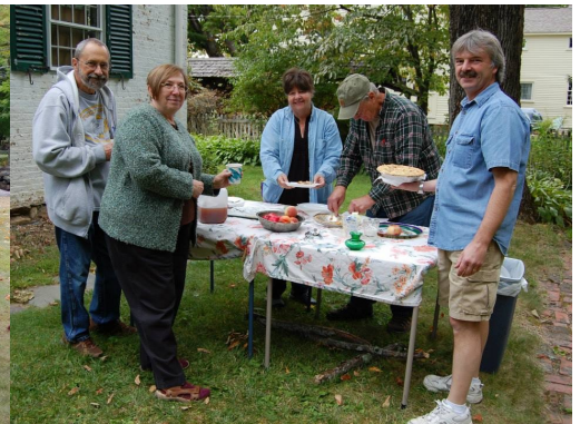
Volunteer food servers