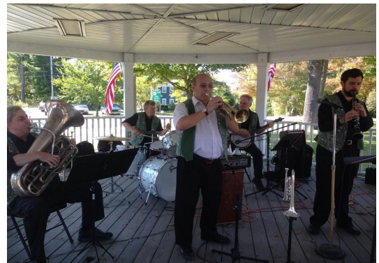
The Thousand Acre Jazz band played great tunes filling the common and making the day more enjoyable for all.