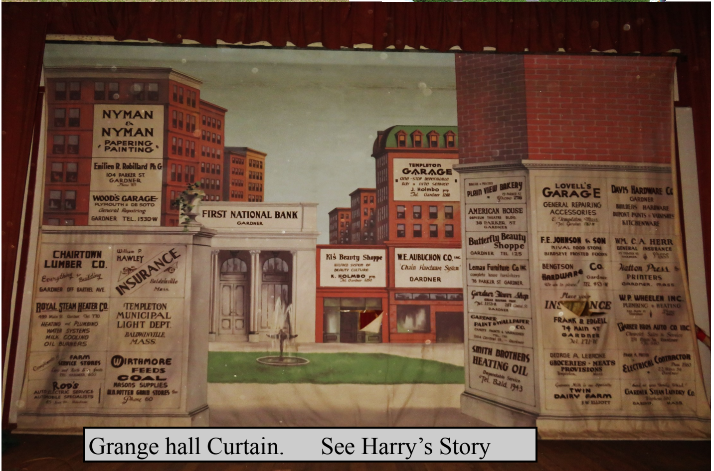
Grange hall Curtain. See Harry's Story