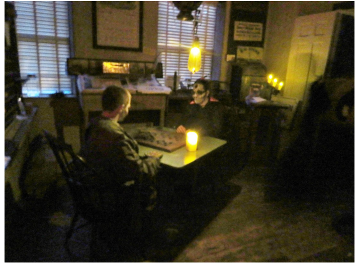
A simple game of checkers? Or a way to win your way out?