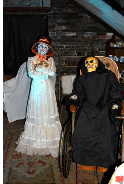
Take a long break in the attic and this Could happen to you.