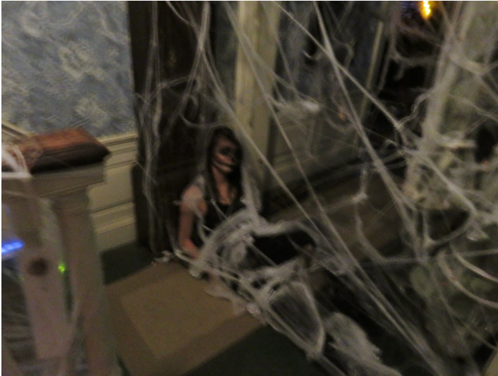
Caught in a web, this poor girl never had a chance.