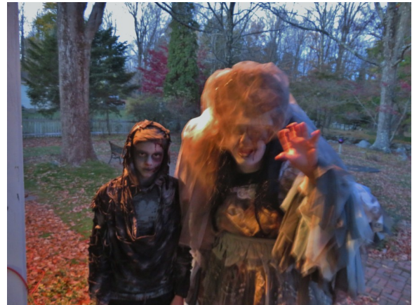
A couple of graveyard dwellers to help you through.