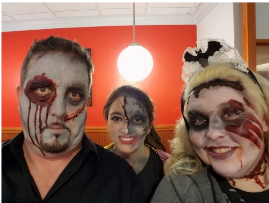
The makeup is second to none. These zombies made a trip Friendly's for a midnight snack.