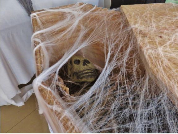
A wake was held for this one. Long overdue I would say