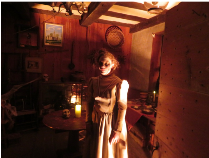
Preparing a meal in the kitchen, what is your favorite snack?