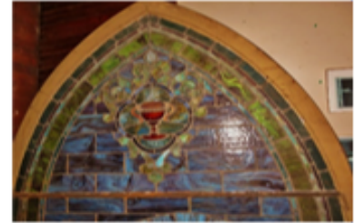
Top of the Church Window