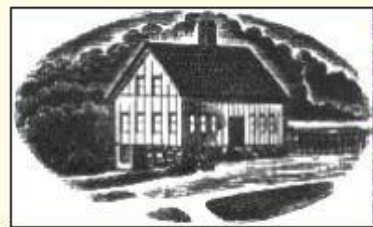
The Wilkinson Machine Shop at Templeton, Massachusetts, where